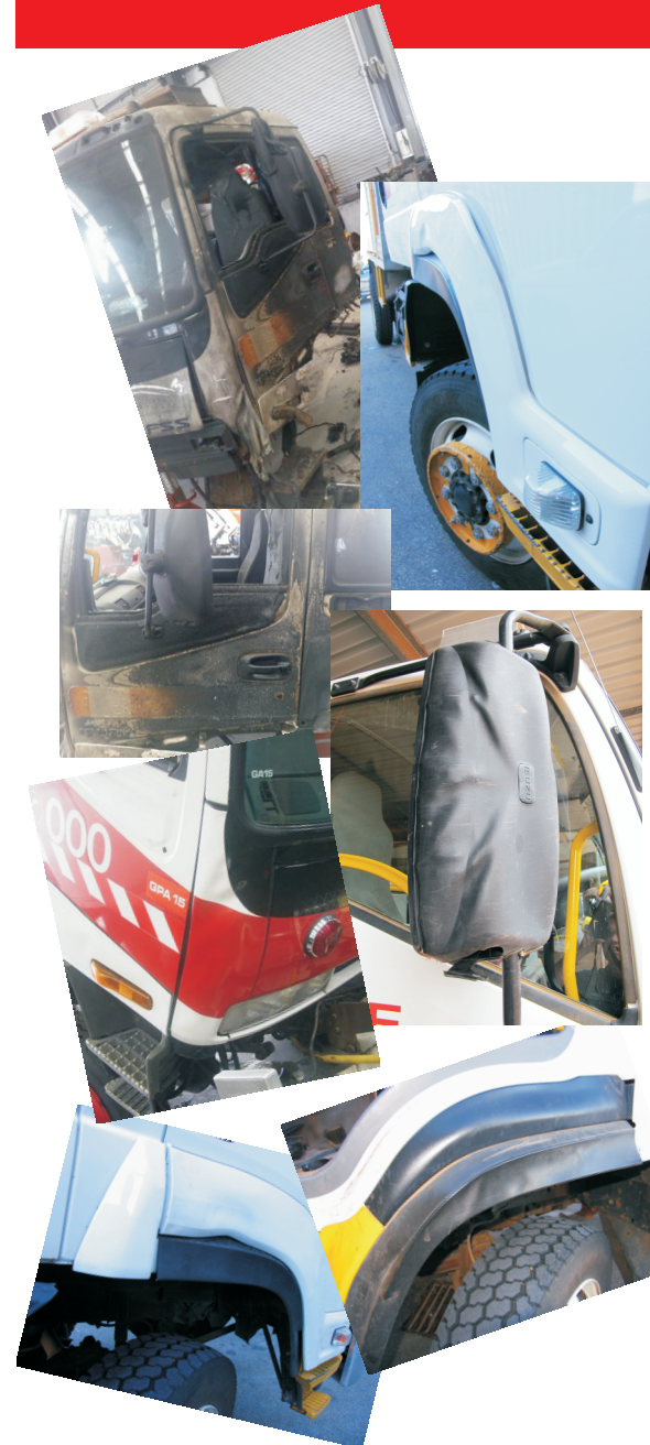
Above: Actual heat/fire damaged vehicles

For Isuzu F & NPS, Hino and Iveco Trucks