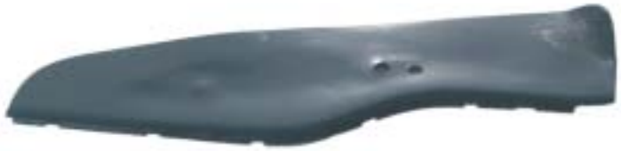
Original plastic panel distorted from heat and is no longer serviceable.