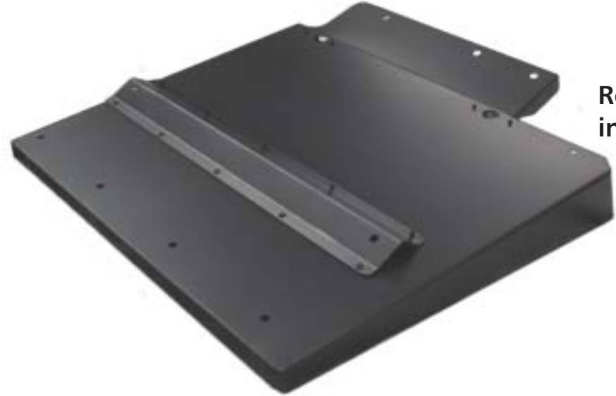
Replacement aluminum mud flap in black.